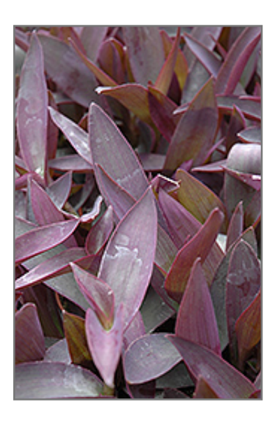
Purple Heart foliage

There are many factors that will affect the ultimate height, spread and overall performance of a plant when grown indoors; among them, the size of the pot it's growing in, the amount of light it receives, watering frequency, the pruning regimen and repotting schedule. Use the information described here as a guideline only; individual performance can and will vary. Please contact the store to speak with one of our experts if you are interested in further details concerning recommendations on pot size, watering, pruning, repotting, etc.