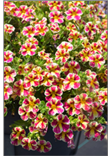
Superbells Holy Moly! Calibrachoa flowers

This plant will require occasional maintenance and upkeep. Trim off the flower heads after they fade and die to encourage more blooms late into the season. It is a good choice for attracting bees and hummingbirds to your yard, but is not particularly attractive to deer who tend to leave it alone in favor of tastier treats. It has no significant negative characteristics.