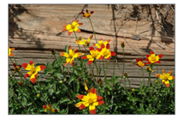
Campfire Fireburst Bidens flowers