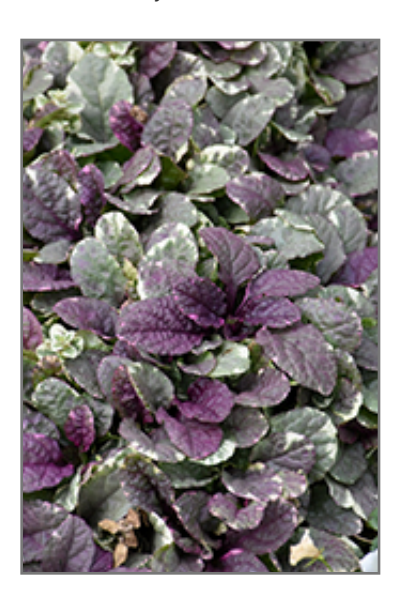
Burgundy Glow Bugleweed foliage