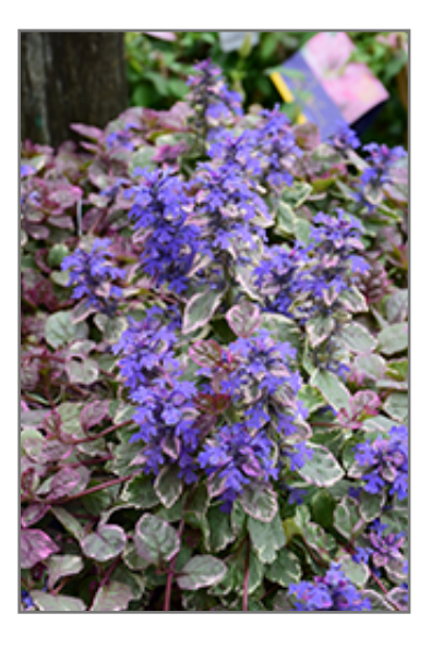
Burgundy Glow Bugleweed flowers

Burgundy Glow Bugleweed is a dense herbaceous evergreen perennial with a ground-hugging habit of growth. Its medium texture blends into the garden, but can always be balanced by a couple of finer or coarser plants for an effective composition.