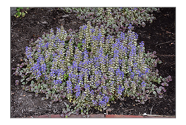
Burgundy Glow Bugleweed in bloom

This plant may not be hardy in our region, and certain restrictions may apply. Please contact the store for further details.