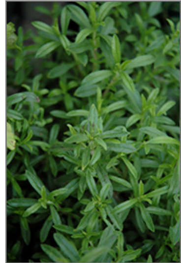
Summer Savory foliage

This plant is quite ornamental as well as edible, and is as much at home in a landscape or flower garden as it is in a designated herb garden. It should only be grown in full sunlight. It is very adaptable to both dry and moist locations, and should do just fine under typical garden conditions. It is not particular as to soil pH, but grows best in poor soils. It is highly tolerant of urban pollution and will even thrive in inner city environments. This species is not originally from North America.