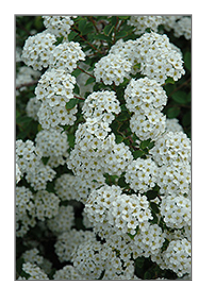
Renaissance Spirea flowers