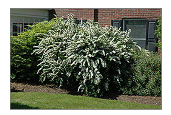
Renaissance Spirea in bloom