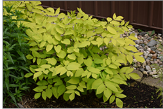
Sun King Japanese Spikenard