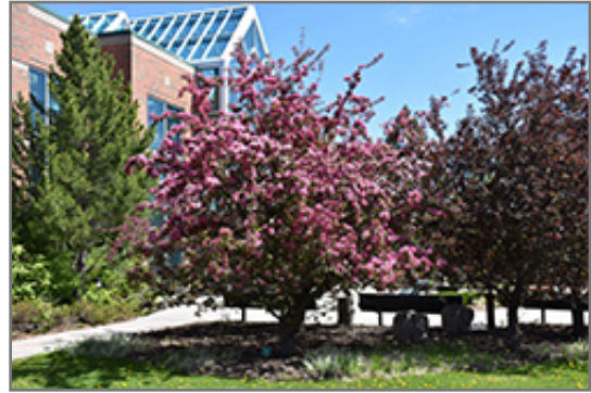
Makamik Flowering Crab in bloom

Makamik Flowering Crab is recommended for the following landscape applications;