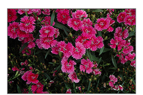
Ideal Select Raspberry Pinks flowers