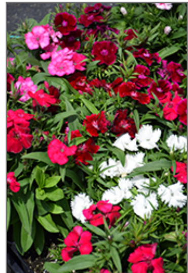
Floral Lace Mix Pinks flowers