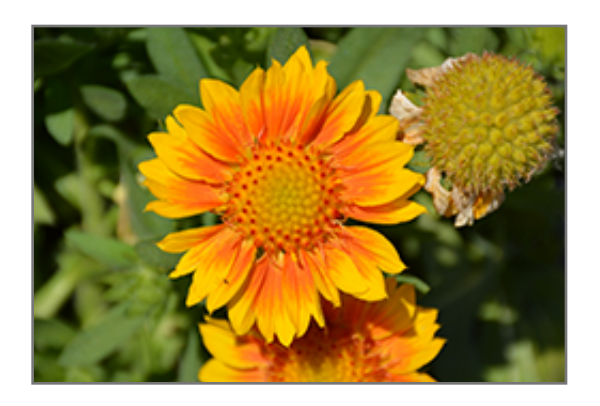
Mesa Peach Blanket Flower flowers