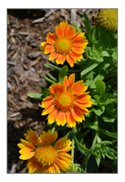
Mesa Peach Blanket Flower flowers