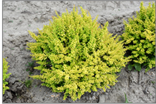
Sunsation Japanese Barberry

Sunsation Japanese Barberry is recommended for the following landscape applications;