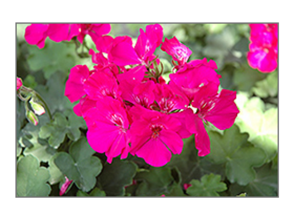
Calliope Lavender Rose Geranium flowers

Large flowers with stunning color; extremely well branched with a vigorous, mounding habit; ideal for large pots, containers, and landscape applications