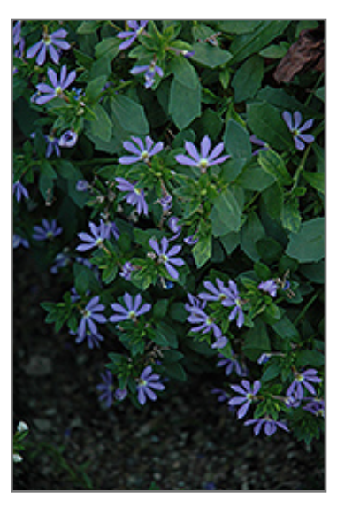
Surdiva Light Blue Fan Flower flowers