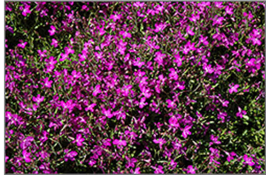
Techno Violet Lobelia flowers

Techno Violet Lobelia will grow to be about 8 inches tall at maturity, with a spread of 12 inches. When grown in masses or used as a bedding plant, individual plants should be spaced approximately 10 inches apart. Its foliage tends to remain low and dense right to the ground. Although it's not a true annual, this fast-growing plant can be expected to behave as an annual in our climate if left outdoors over the winter, usually needing replacement the following year. As such, gardeners should take into consideration that it will perform differently than it would in its native habitat.