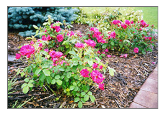
Morden Amorette Rose in bloom