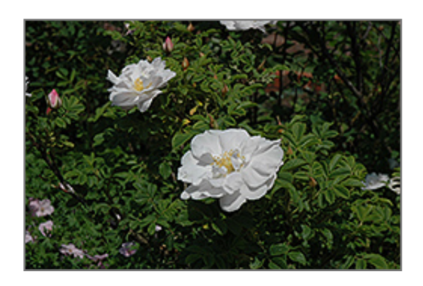
Henry Hudson Rose flowers

Henry Hudson Rose is recommended for the following landscape applications;