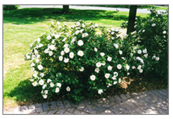
Henry Hudson Rose in bloom