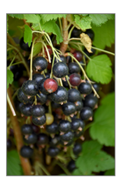
Ben Sarek Black Currant fruit

This is a dense multi-stemmed deciduous shrub with a more or less rounded form. Its relatively fine texture sets it apart from other landscape plants with less refined foliage. This plant will require occasional maintenance and upkeep, and is best pruned in late winter once the threat of extreme cold has passed. It is a good choice for attracting birds to your yard. It has no significant negative characteristics.