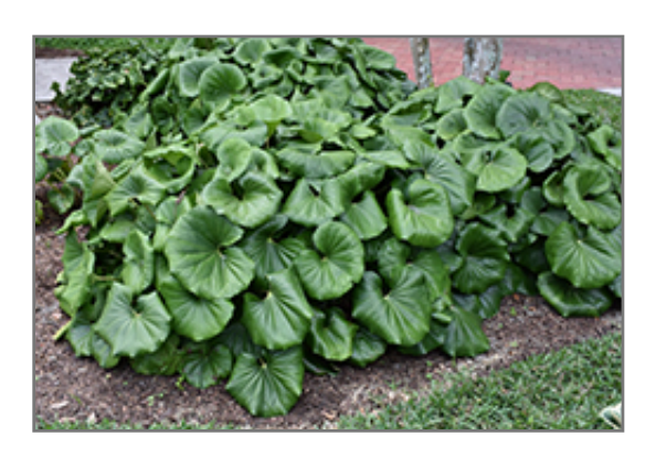
Giant Leopard Plant

Giant Leopard Plant is recommended for the following landscape applications;